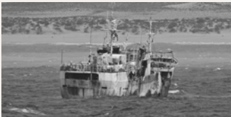
The Naham 3 off the coast of Somalia (EUNAVFOR)