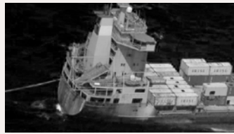
The Albedo (EUNAVFOR)