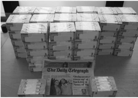
A 7.7m ransom delivery in a bank vault prior to delivery (Richard Neylon)