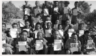
Naham 3 proof of life photo. Each sailor holds up a paper showing a security code (Leslie Edwards)